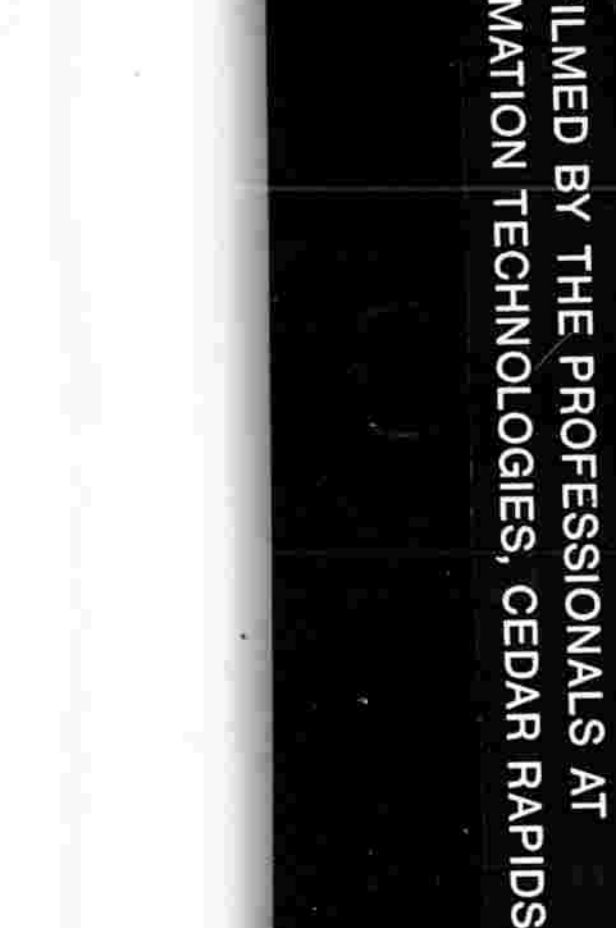
FLIMED BY THE PROFESSIONALS AT CREST INFORMATION TECHNOLOGIES, CEAR RAPIDS, IOWA

"Take tuxedos, for example," she says. "Every man looks elegant in a tux because it's part of the whole fantasy of limousines, champagne, dancing till dawn and Tom Cruise in the Oscars."