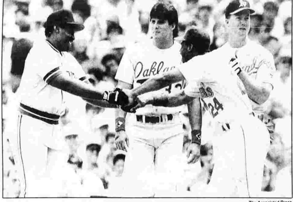
CENTER OF ATTENTION — Detroit's Cecil Fielder, left, shakes hands with Seattle's Ken Griffey Jr. as they are introduced along with Oakland teammates Mark McGwire, right, and Jose Canseco at the star of the All-Star home run contest Monday at Chicago's Wrigley Field.

Bolton also began District Eight play on the road Monday night and it, too, came home a winner with an 11-6 victory over Windsor.